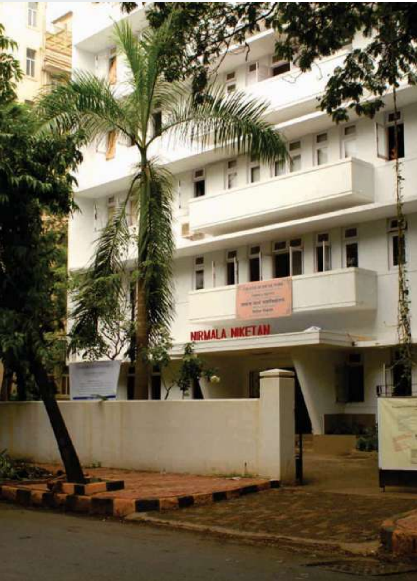
Nirmala Niketan College