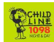
Childline India Foundation