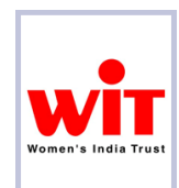
Women's India Trust