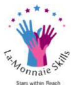
La Monnaie Skills