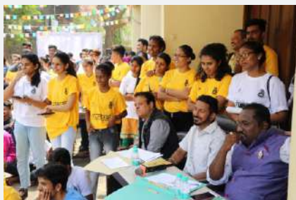
Riwayat - College Fest