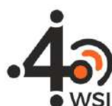
4 th Wheel Social Impact