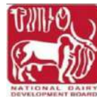
National Dairy Development Board (NDDB)