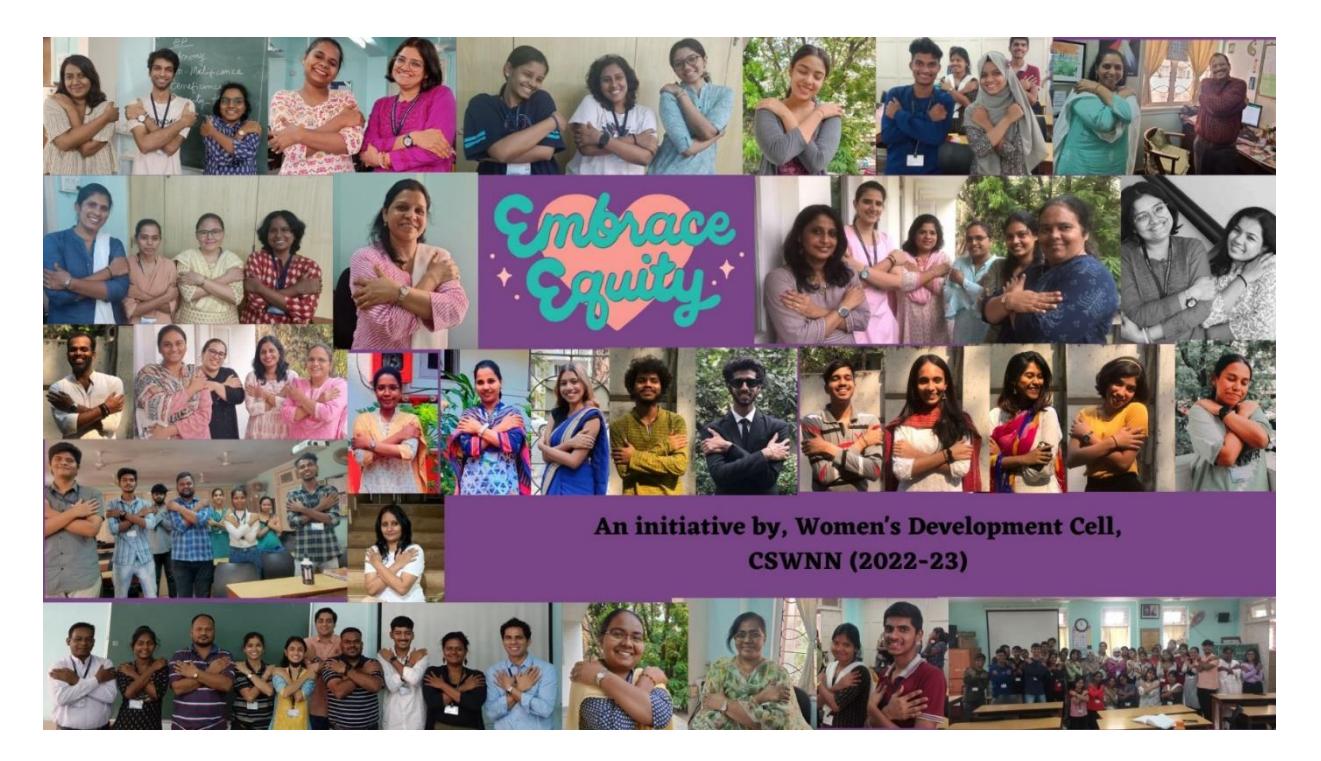
Collage on Embrace Equity Selfie Posted by students on Social media platforms