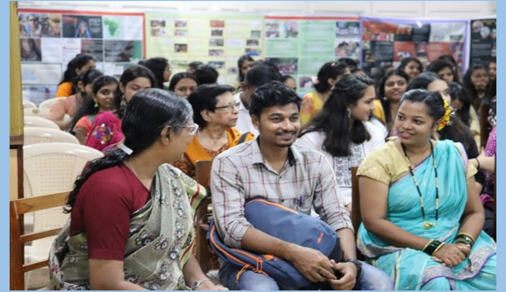
Warli Art workshop