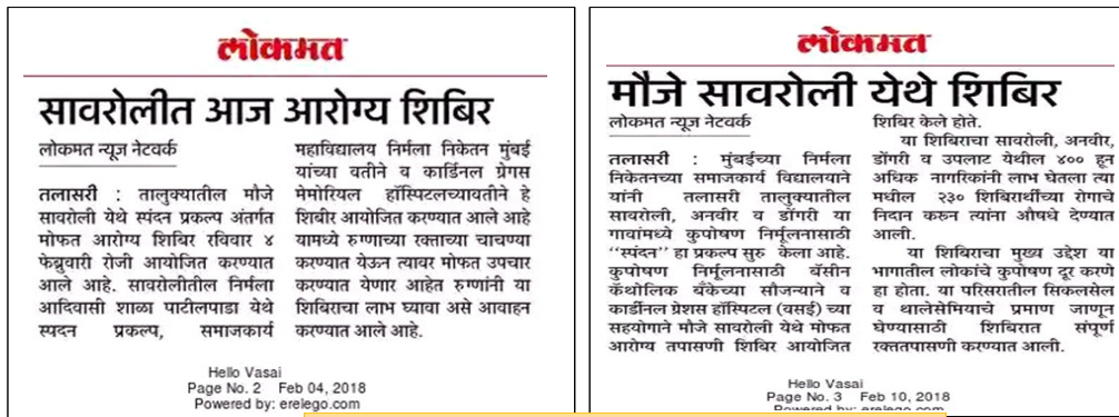
NEWSPAPER COVERAGE: SPANDHAN

Various activities undertaken by SPANDHAN are Participatory Rural Appraisal, Anthropometric Measurements, Prabath Pheri to Create awareness about malnutrition, Capacity building programe of Asha workers, Bal melwa, Health camp for tribals, Sessions for children: self-awareness, morals, values and personality development, personal hygiene, Sessions for adolescents/ adults: menstrual hygiene practices, breastfeeding. demonstration of low-cost nutritive recipes, life skills effective communication, interpersonal relationship, decision making)