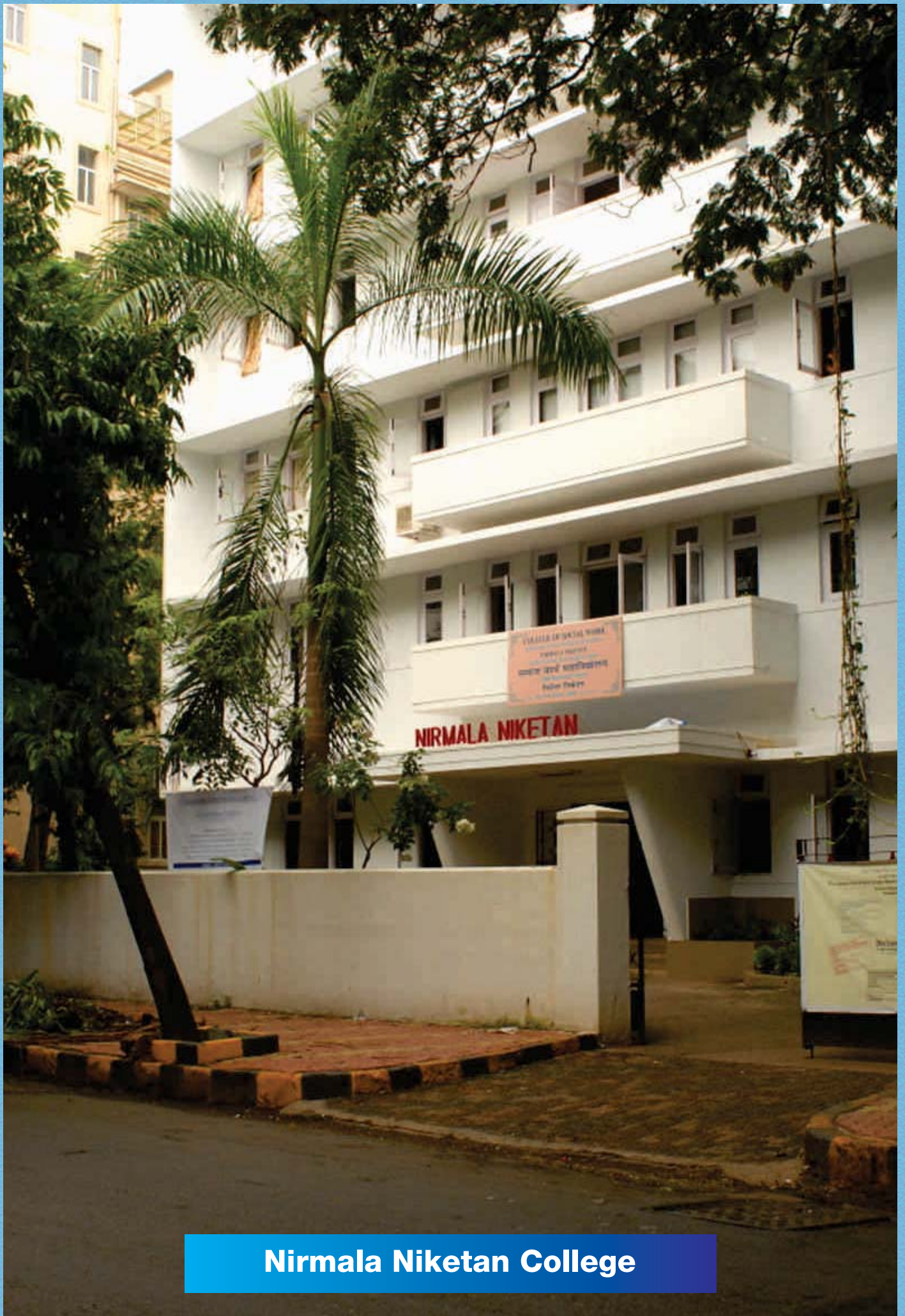
Nirmala Niketan College